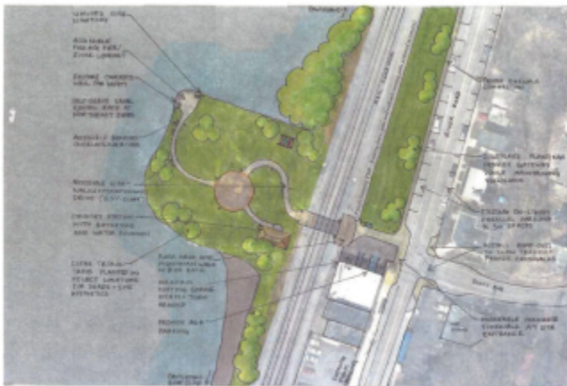
RENSSELAER COUNTY HUDSON RIVER ACCESS PLAN Vision & Scenarioplanning Hudson 2019 Figure 2-7