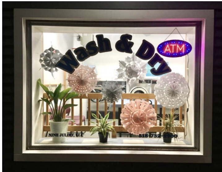
Seen around Main Street