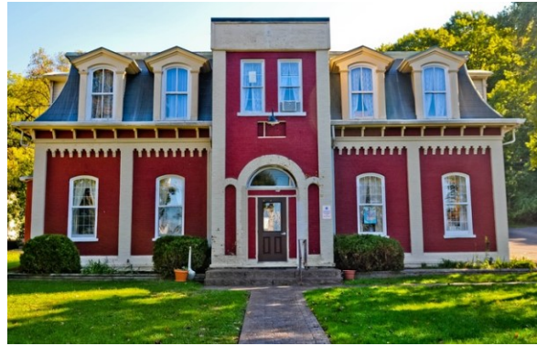
CASTLETON ON HUDSON, NEW YORK

There is no charge for this service to our residents.